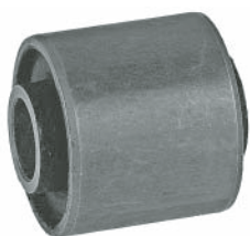
SWAG 62 13 0006 Ref. No. 1809.21