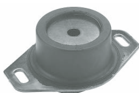
SWAG 64 13 0007 Ref. No. 1844.72