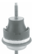
SWAG 64 13 0005 Ref. No. 1844.36