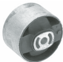
SWAG 64 13 0001 Ref. No. 1809.22