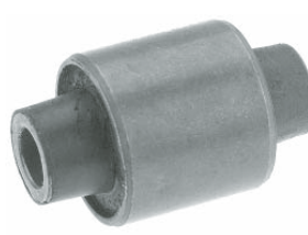
SWAG 64 13 0002 Ref. No. 1844.51