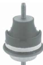
SWAG 64 13 0008 Ref. No. 1844.75