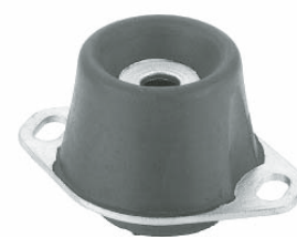
SWAG 64 13 0004 Ref. No. 1844.42