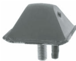
SWAG 64 13 0004 Ref. No. 1844.42