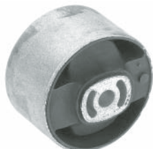
SWAG 62 13 0005 Ref. No. 1843.95