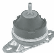
SWAG 64 13 0014 Ref. No. 1844.93