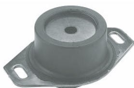
SWAG 64 13 0013 Ref. No. 1844.92