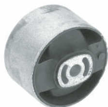
SWAG 64 13 0005 Ref. No. 1844.36