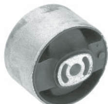
SWAG 64 13 0011 Ref. No. 1827.16