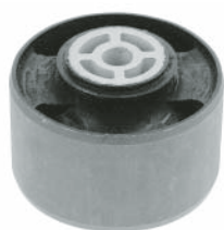
SWAG 62 13 0006 Ref. No. 1809.21