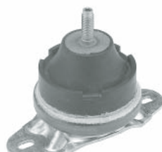
SWAG 64 13 0014 Ref. No. 1844.93