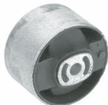
SWAG 64 13 0011 Ref. No. 1827.16