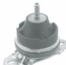
SWAG 64 13 0015 Ref. No. 1827.10