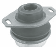
SWAG 64 13 0014 Ref. No. 1844.93