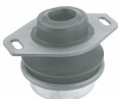
SWAG 64 13 0013 Ref. No. 1844.92