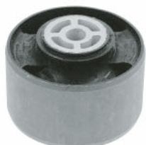
SWAG 62 13 0006 Ref. No. 1809.21