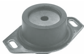
SWAG 64 13 0006 Ref. No. 1844.68