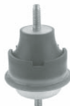
SWAG 64 13 0009 Ref. No. 1844.77