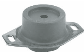
SWAG 64 13 0008 Ref. No. 1844.75