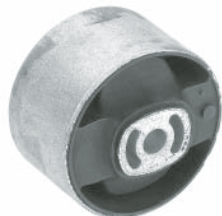
SWAG 64 13 0005 Ref. No. 1844.36