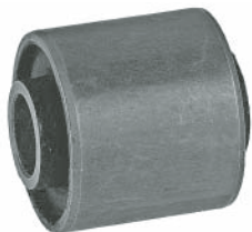
SWAG 62 13 0006 Ref. No. 1809.21