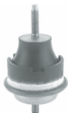
SWAG 64 13 0005 Ref. No. 1844.36