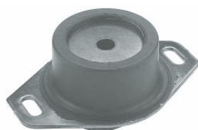
SWAG 64 13 0007 Ref. No. 1844.72