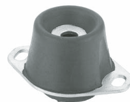
SWAG 64 13 0004 Ref. No. 1844.42