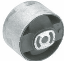
SWAG 64 13 0001 Ref. No. 1809.22