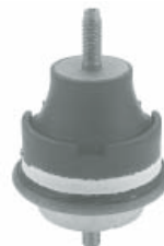
SWAG 64 13 0008 Ref. No. 1844.75