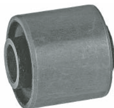
SWAG 62 13 0006 Ref. No. 1809.21